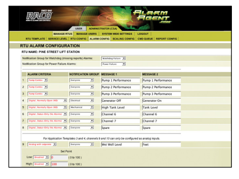
WRTU Channel Configuration Screen Reconfigure channels in seconds.

AlarmAgent.com provides extreme flexibility for custom configuration. Add stations. Change alarm parameters. Manage users and update their notification preferences. All this functionality and more is possible through clear instructions and drop-down menus that allow you to manage your selections in just seconds.