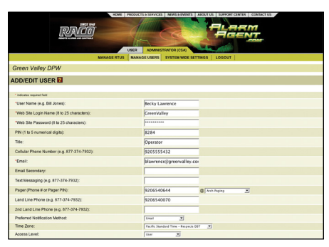
Add/Edit User Screen Easily change user permissions and preferences