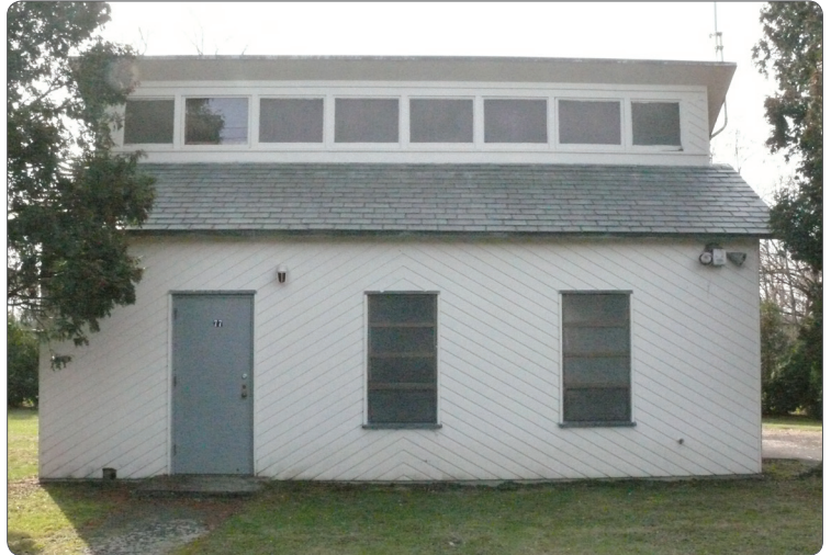
The unmanned and remote Stanley Street lift station is under constant surveillance thanks to AlarmAgent.com